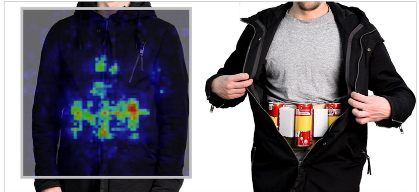
Dummy explosive belt

The TeraSense team has taken on these challenges seriously and is now ready to offer our own active terahertz-based stand-off security screening system ('body scanner').