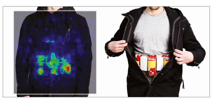
Dummy explosie belt